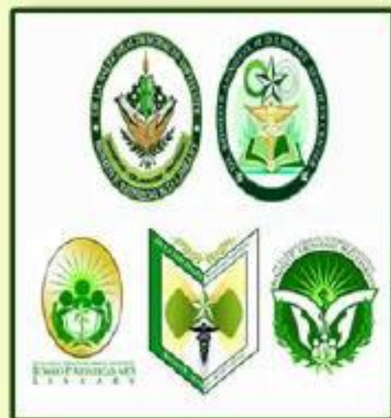
Top Five Entries